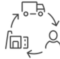
Supply Chain (including modern slavery)