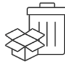
Waste & Packaging

Following the identification of these material topics, an ESG strategy was developed and an ESG Governance Structure was formalised to oversee the implementation of the strategy, with modern slavery prioritised for strategic action. The ESG Governance Structure includes the governance of modern slavery and human trafficking risk and due diligence, and the Board is ultimately responsible for the Group's ESG strategy, reviewing its effectiveness, establishing and communicating ESG-related policies, and reviewing overall progress against the ESG strategy.