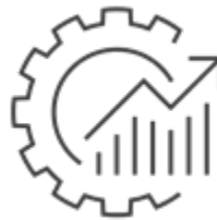
Productivity & Efficiency